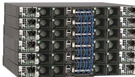
Figure 4: Up to 12 Ruckus ICX 7750 Switches can be stacked using up to 12 standard full-duplex 40 Gbps QSFP+ ports per switch, providing up to 5.76 Tbps of aggregated stacking bandwidth.

Ruckus Multi-Chassis Trunking (MCT) supports dual homing of wiring closet access switches, or servers in a rack, to two Ruckus ICX 7750 switches in an MCT peer group, eliminating the risk of a single point of failure. In conjunction with MCT, VRRP-E (the Ruckus extension to VRRP for MCT) provides redundancy and sub-second failover for both Layer 2 and Layer 3. For metro or campus deployments in a ring topology, the Ruckus Metro Ring Protocol (MRP-I and MRP-II) prevents Layer 2 loops and enables faster re-convergence than Spanning Tree Protocol (STP) with sub-second failover.