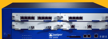
Juniper Networks ISG 2000